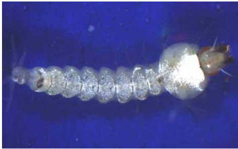
Collarless (c+) is caused by a uric acid build-up in the larvae. Expression is often variable but best seen in L4 larvae. SUA is monomorphic for this trait.