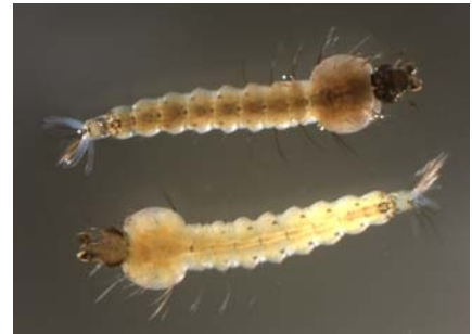
When reared in a dark pan, larvae with wild-type eye color will melanize when compared to a cohort reared in a white pan.