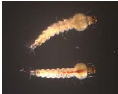
Red stripe-if present, individuals expressing red stripe are female